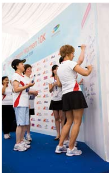
Ambassadors endorsing the 'Women Against Cancer' cause.

And so it was for the women who ran the city. Life is great indeed!